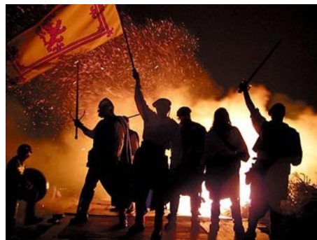
◀ Scottish ceremony, Hogmanay