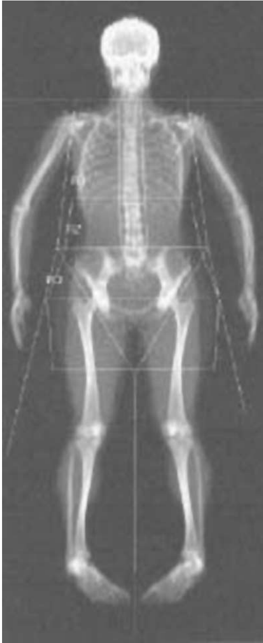
Figure 2 Whole-body DXA scan with regional soft tissue analysis.

MO, USA) using a Cobra II series auto-gamma counting system (Packard Instrument Company; Meriden, CT, USA). We used the manufacturer-provided quality controls and in-house quality control sera/plasma for calculating intra- and inter-assay coefficient of variation (CV). The intra- and inter-assay CVs (%) for adiponectin, leptin, insulin, and ghrelin were 1.6 and 1.5, 3.0 and 2.7, 2.3 and 4.0, and 3.4 and 3.1 respectively.